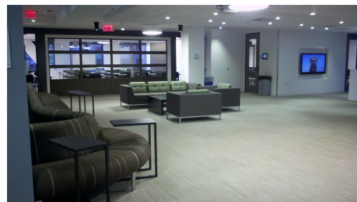
Fourth Floor Meeting Area