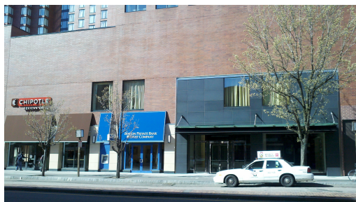
Street View of Boston Properties Entrance (for arrival after 5pm)